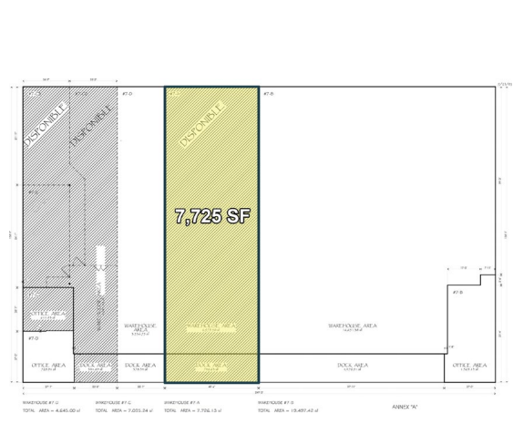
Suite 9B Site Plan