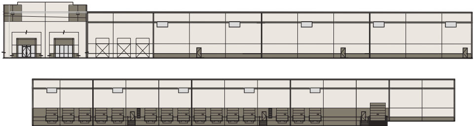
PHASE 1 CONCEPTUAL ELEVATIONS